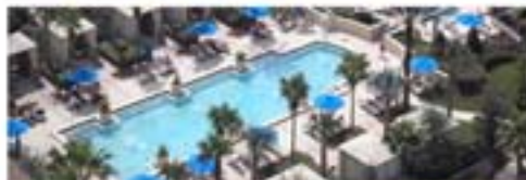
Left: The Omni Resort Hotel Above: Neighboring Property